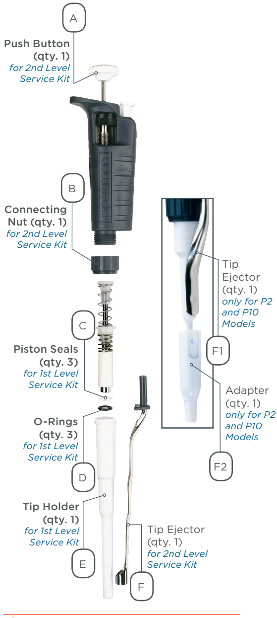
Figure 8 Spare Parts Identified