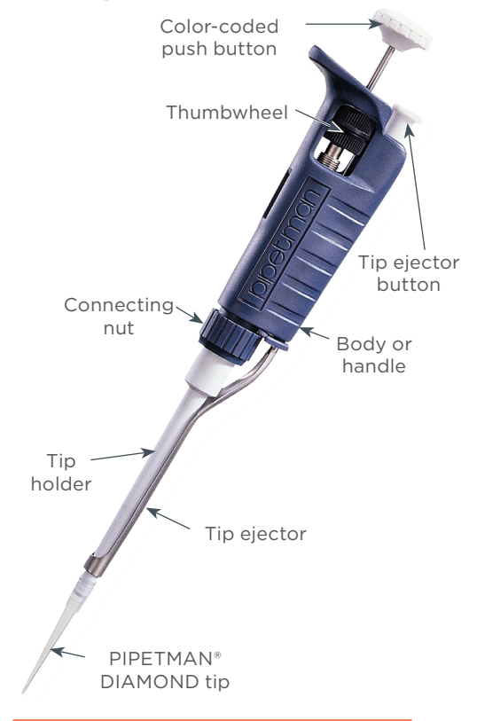
Figure 2 PIPETMAN® Classic