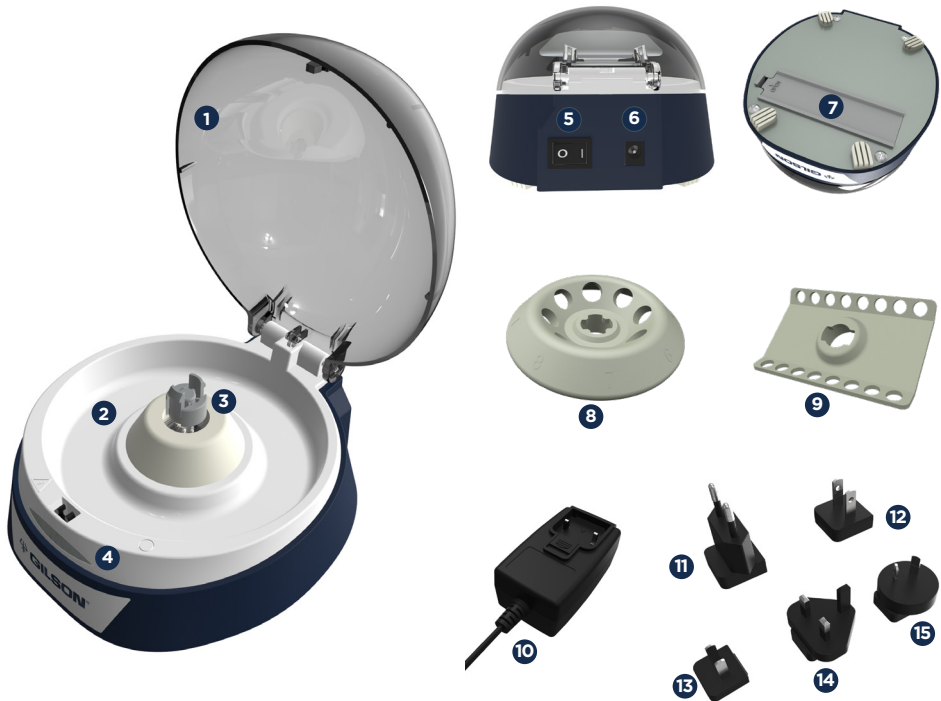
Figure 1 CENTRY™ 103 Minicentrifuge components